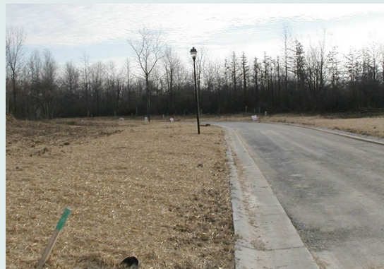
Example of permanent stabilization: seed covered by straw mulching